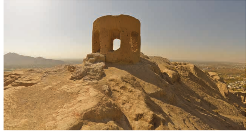
'Zarathustrian' 2014, Medium C type print, size 70cm x 130 cm, edition 4