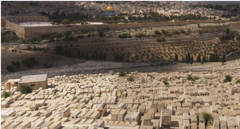
'Al Haram Al Sharif - Ground Zero', 2014 Medium C type print, size 70cm x 130 cm, edition 4