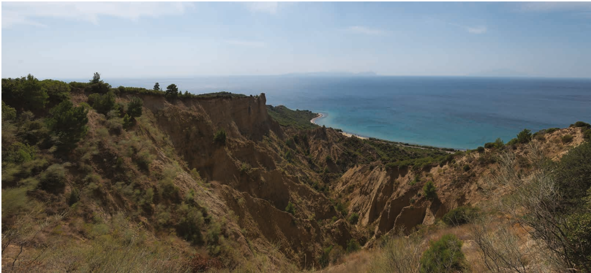
'The other side of Lambert' - 2013, Medium C type print, size 50 cm x 160 cm, edition 4