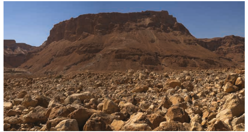
'Resistance Masada', 2014, Medium C type print, size 70cm x 130 cm, edition 4