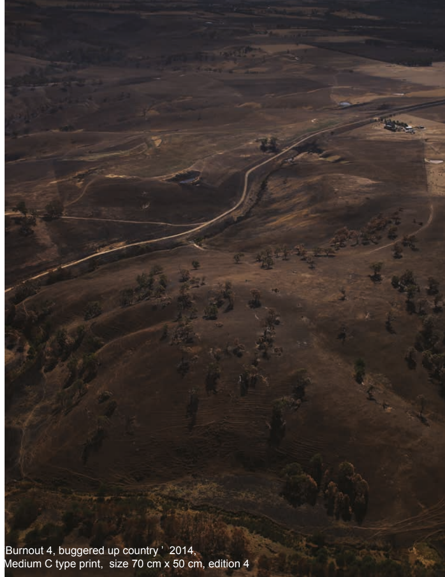
Burnout 4, 'buggered up country' 2014, Medium C type print, size 70 cm x 50 cm, edition 4