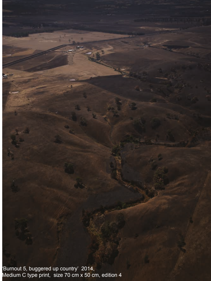
Burnout 5, 'buggered up country' 2014, Medium C type print, size 70 cm x 50 cm, edition 4