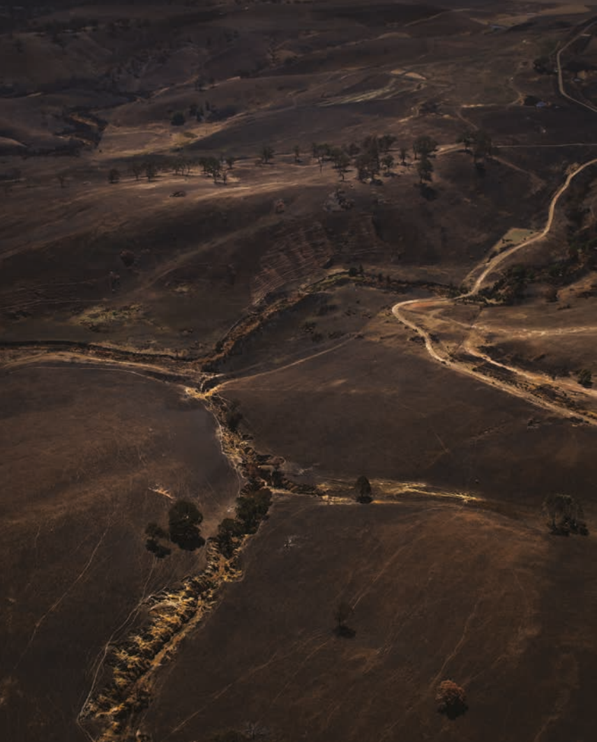
'Burnout 1, bugged up country' 2014, Medium C type print, size 70 cm x 50 cm, edition 4