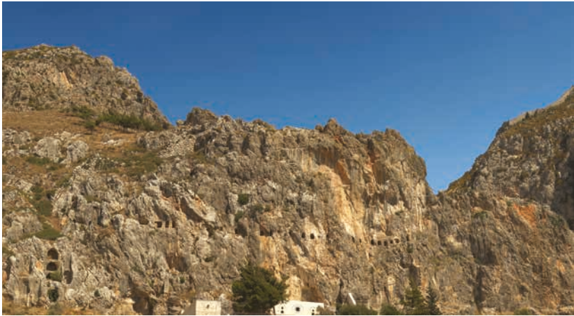
'Antioch' 2014, Medium C type print, size 70cm x 130 cm, edition 4