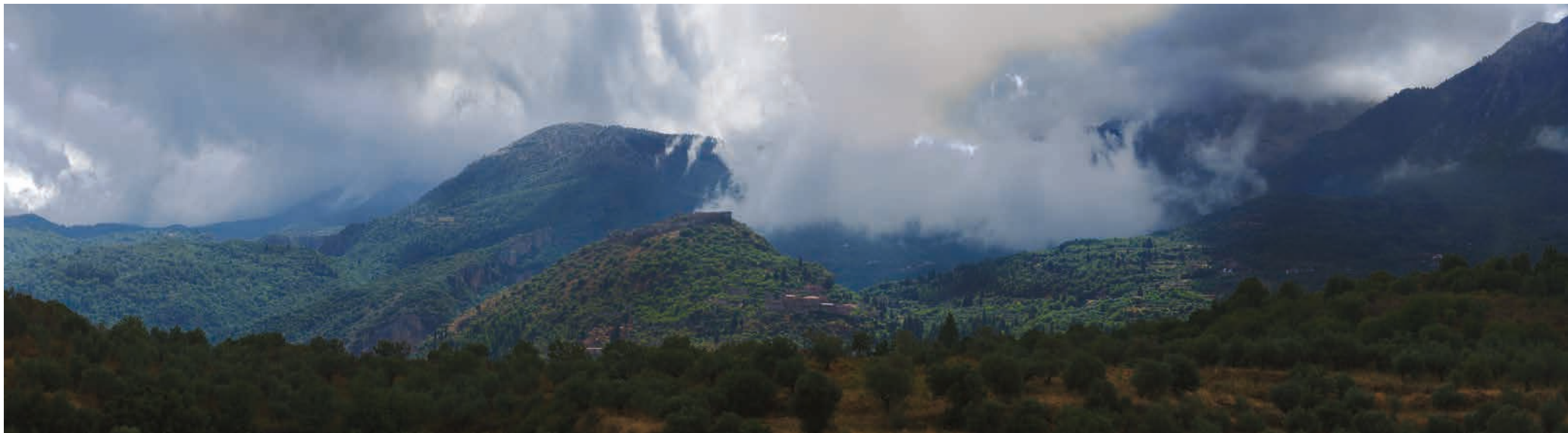
'Mystras', 2014, Medium C type print, size 70 cm x 264 cm, edition 4