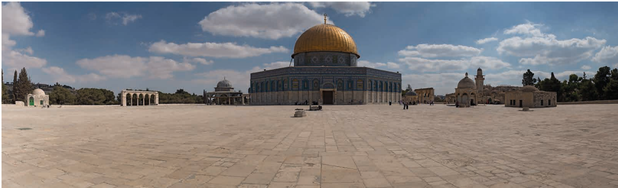
'Temple'- 2014, Medium C type print, size 70cm x 254cm, edition 4