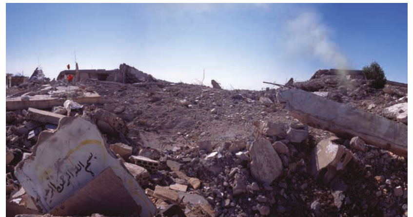
'Resistance - the South' 2006, Medium C type print, size 70cm x 130 cm, edition 4