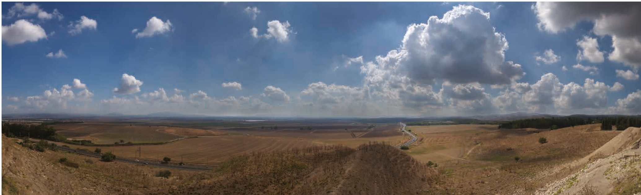
'Armageddon'- 2014, Medium C type print, size 70cm x 240cm, edition 4