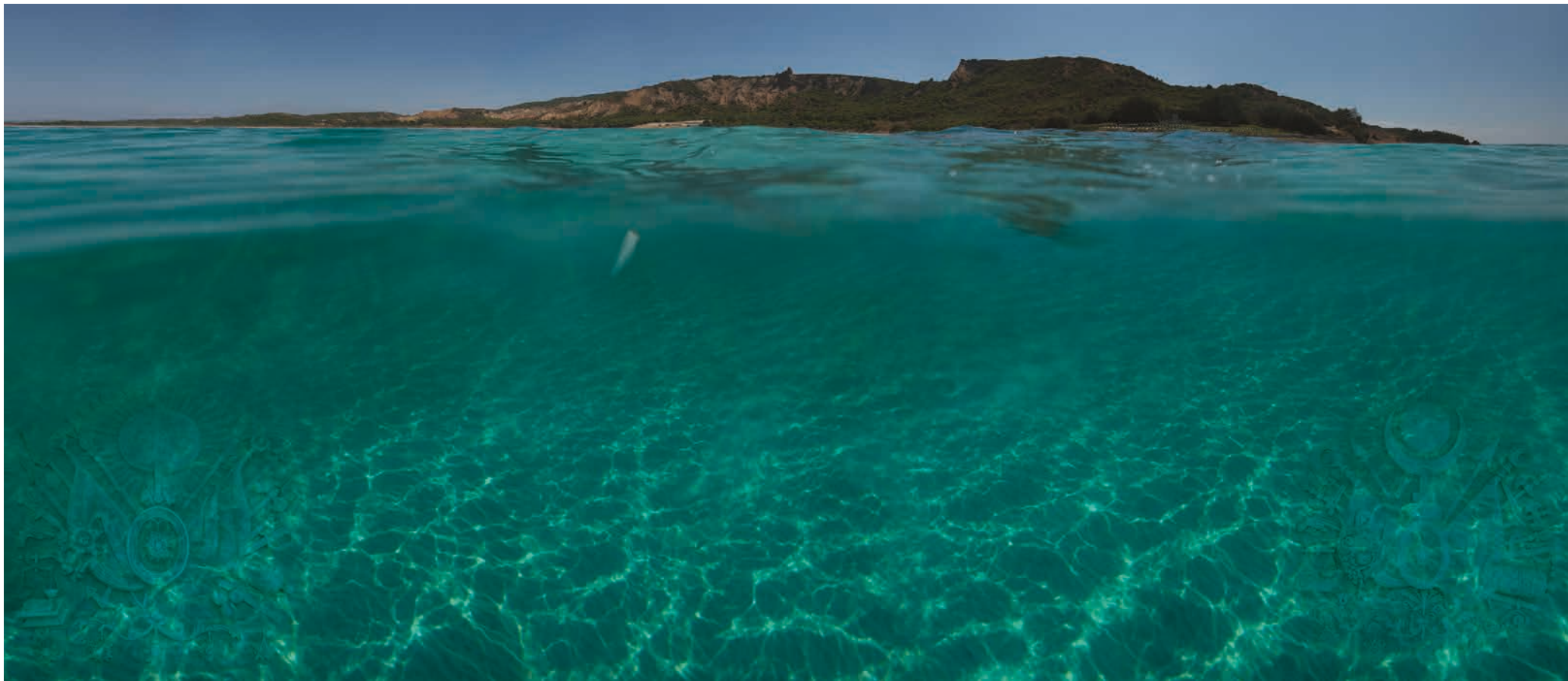
'Gallipoli Landing coordinates 224 G'- 2014, Medium C type print, size 113cm x 264cm, edition 4