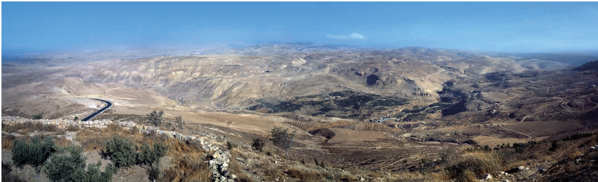
'Mt Nebo'- 2006, Medium C type print, size 70cm x 230cm, edition 4