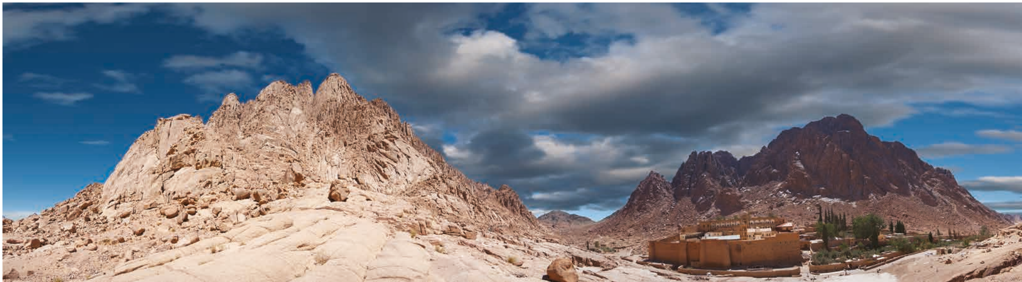
'Mt Sinai', 2008, Medium C type print, size 70 cm x 264 cm, edition 4