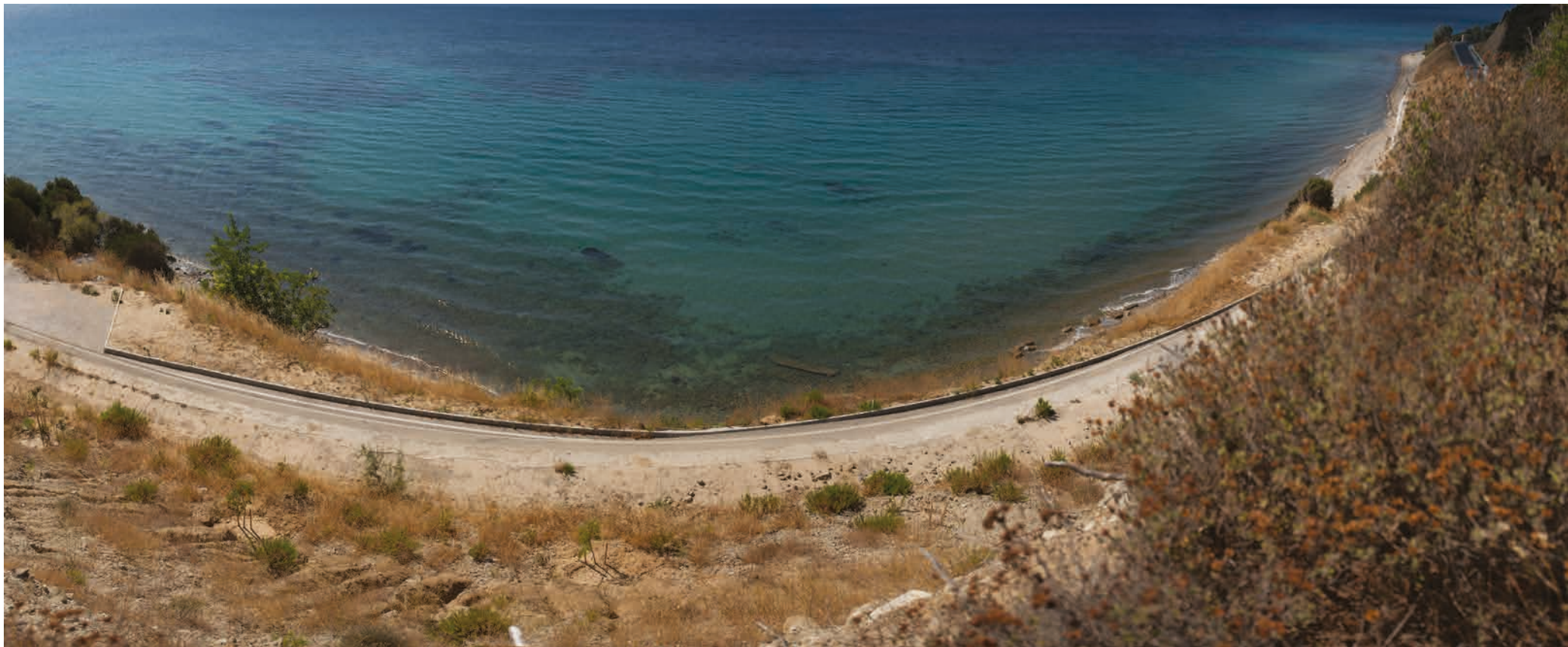
'View down to Anzac Cove' - 2013, Medium C type print, size 50 cm x 160 cm, edition 4