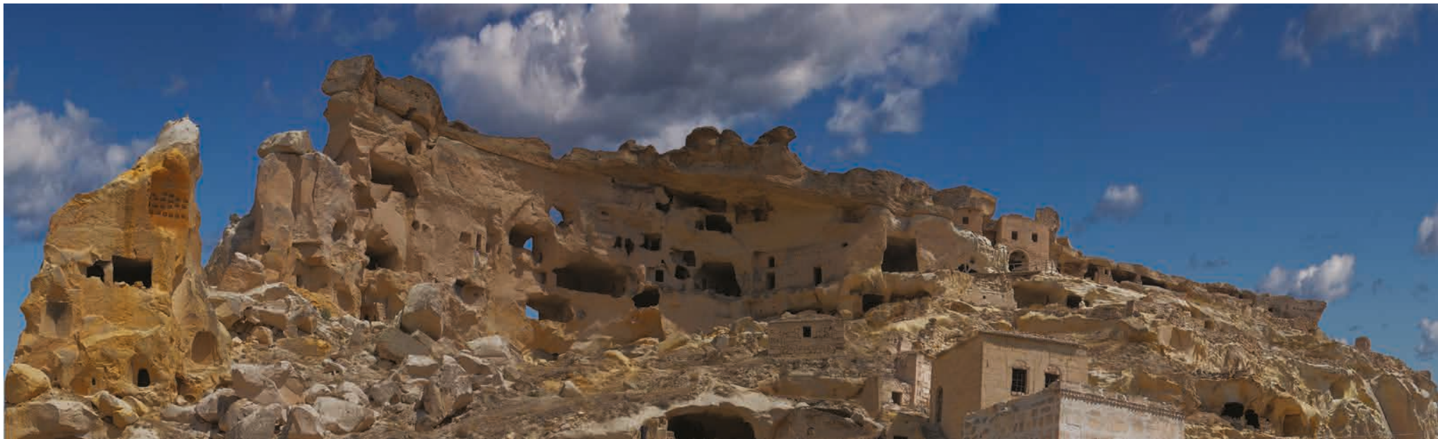
'Habitat'- 2014, Medium C type print, size 70cm x 230 cm, edition 4