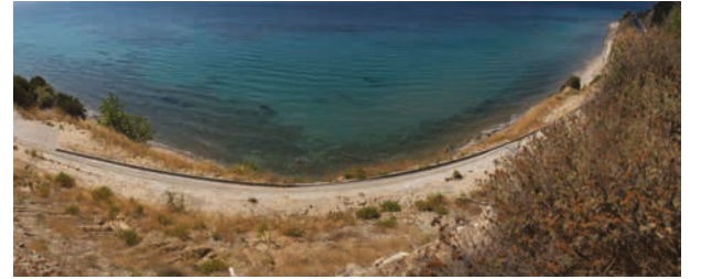
'Ottoman View points'