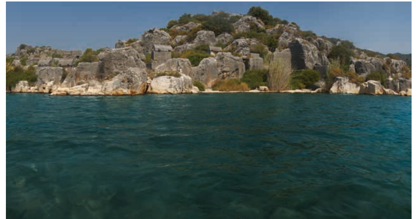
'Lycian Trace' 2014, Medium C type print, size 70cm x 130 cm, edition 4