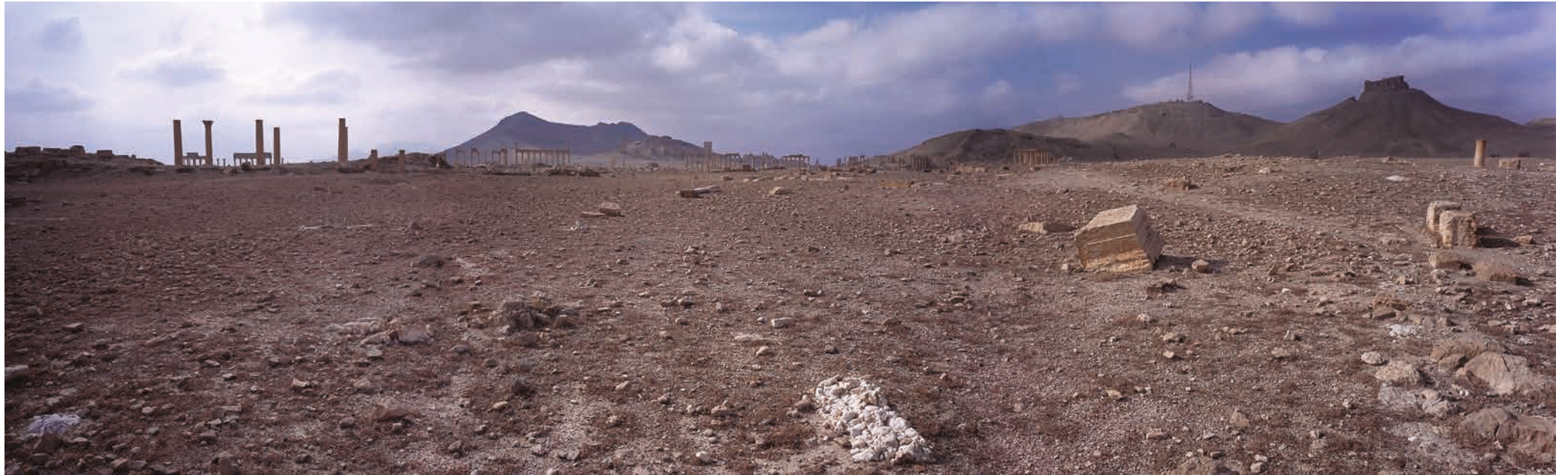
'Trace # 1'- 2005, Medium C type print, size 70 cm x 230 cm, edition 4