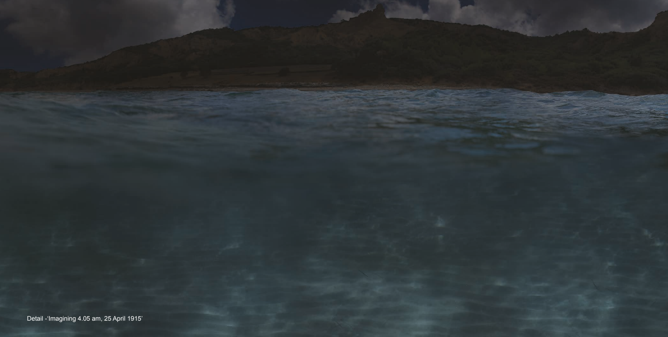
Detail -'Imagining 4.05 am, 25 April 1915'