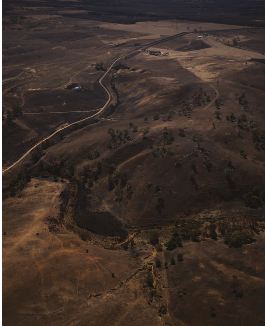
'Burnout 2, bugged up country' 2014, Medium C type print, size 70 cm x 50 cm, edition 4