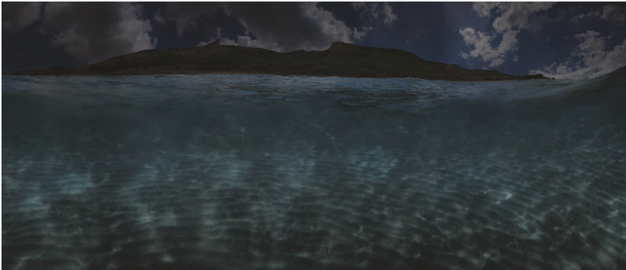
'Imagining 4.05 am, 25 April 1915' - 2015, Medium C type print, size 113cm x 264cm, edition 4