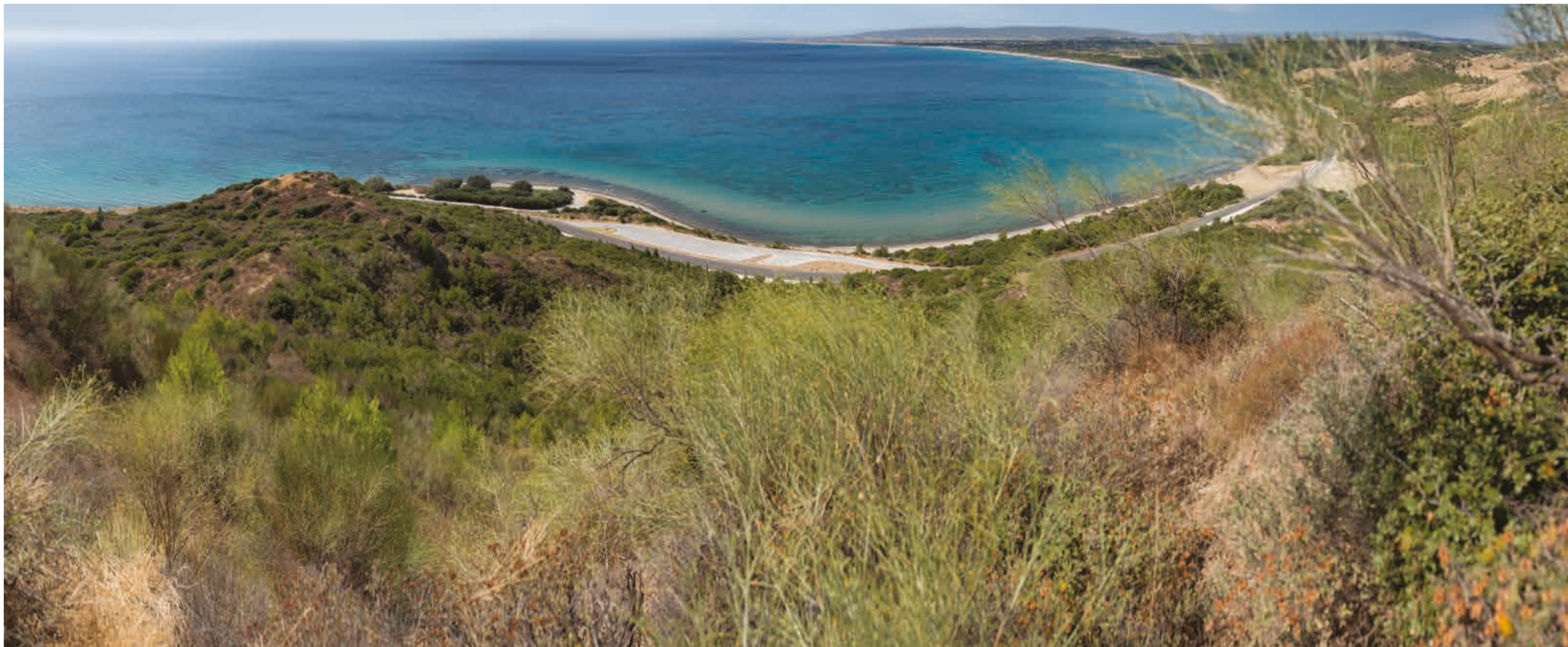
'Z Beach Ottoman view of the Gallipoli Landing' - 2013 , Medium C type print, size 50 cm x 160 cm, edition 4