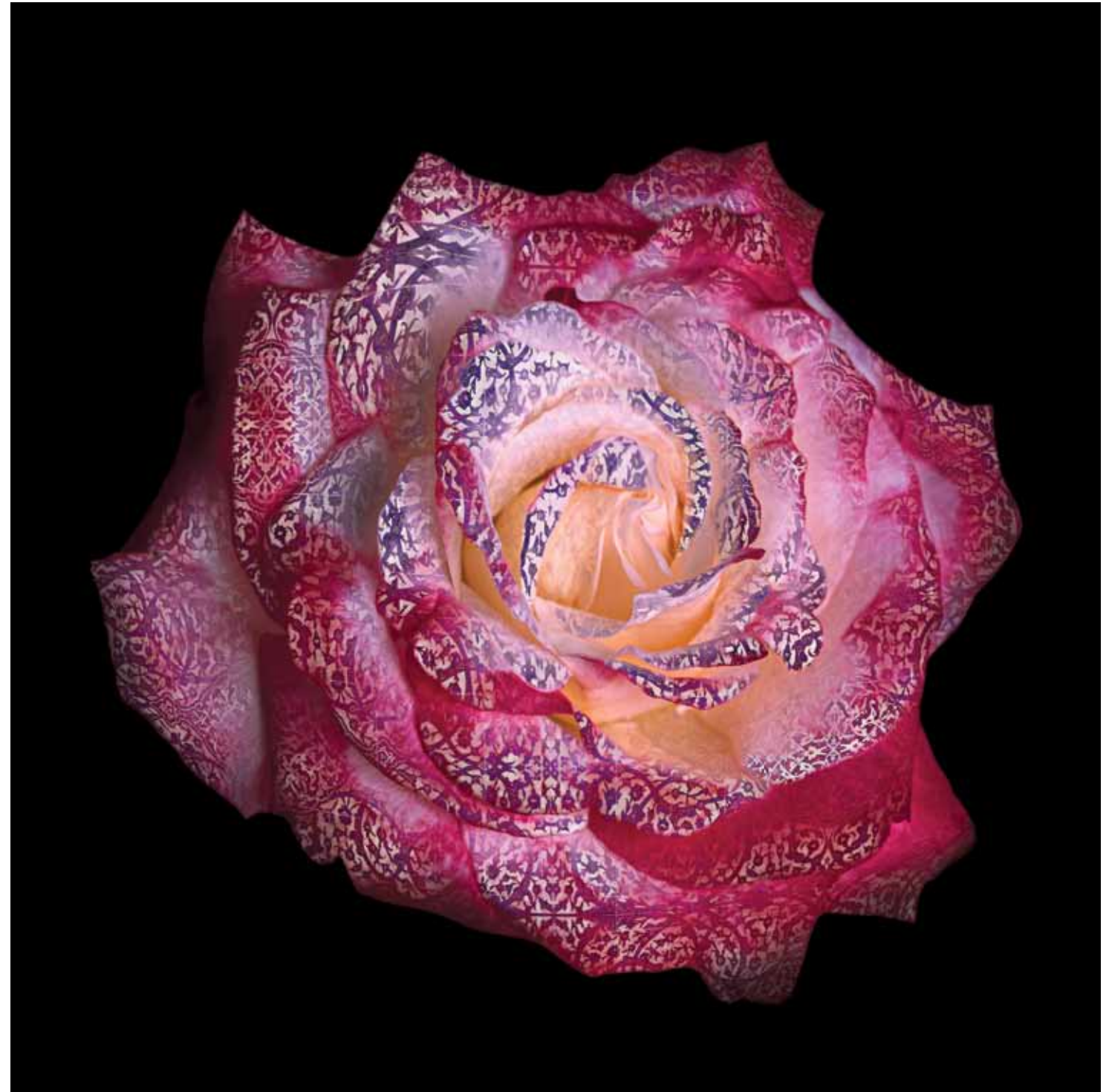
“The Paradise Suite -Al Naiyan” C- Type print, 2010, 100 x 100cm 1/3