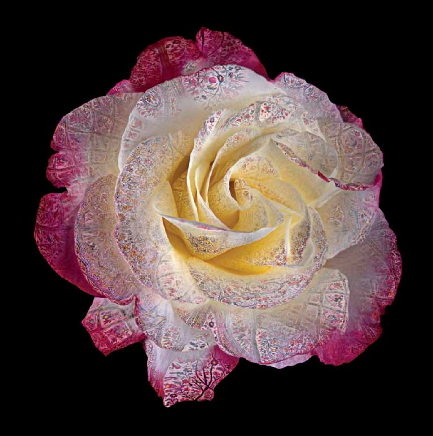
“The Paradise Suite -Persia” C-Type print , 2010, 100 x 100cm 1/3