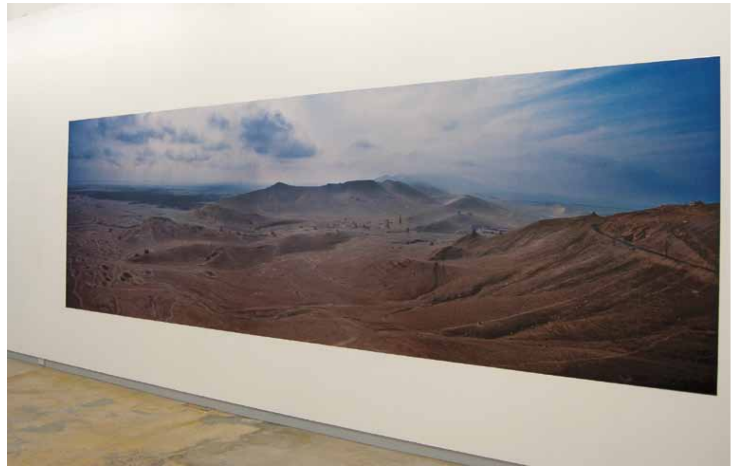
Instillation view Breensapce gallery 2010