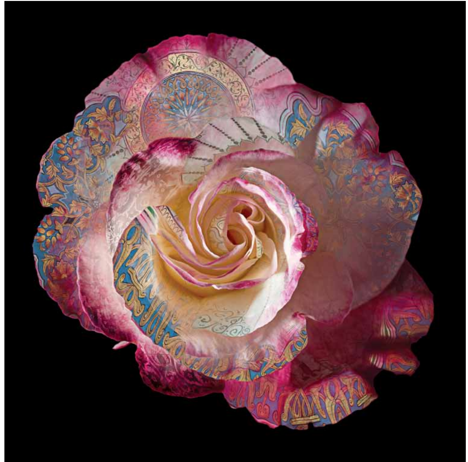
“The Paradise Suite - Tamil” C -Type print , 2010,100 x 100cm 1/3