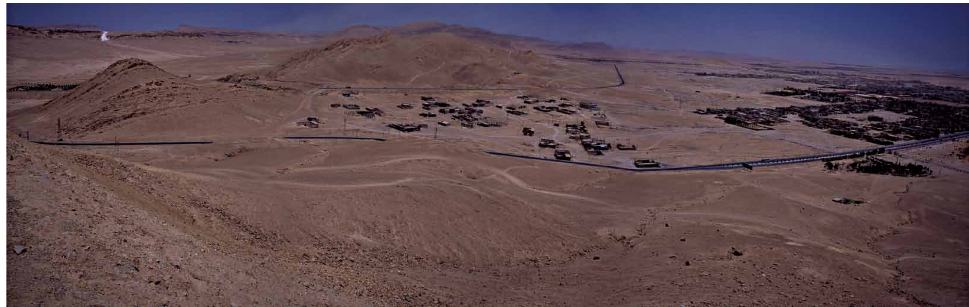
“Road to Baghdad”, Vinyl print, 2010, 90 cm x 300 cm