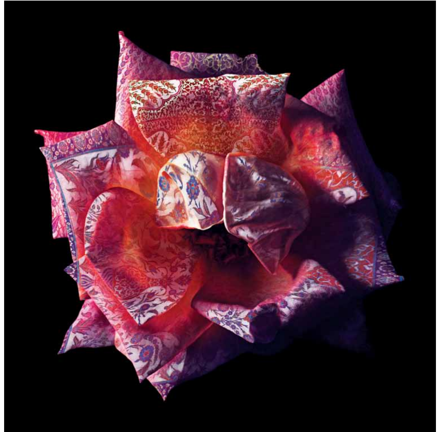
"The Paradise Suite -#1East" C-Type print , 2010,100 x 100cm 1/3