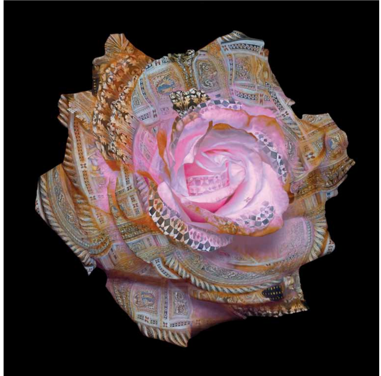
“The Paradise Suite -Fireze” C -Type print, 2010, 100 x 100cm 1/3