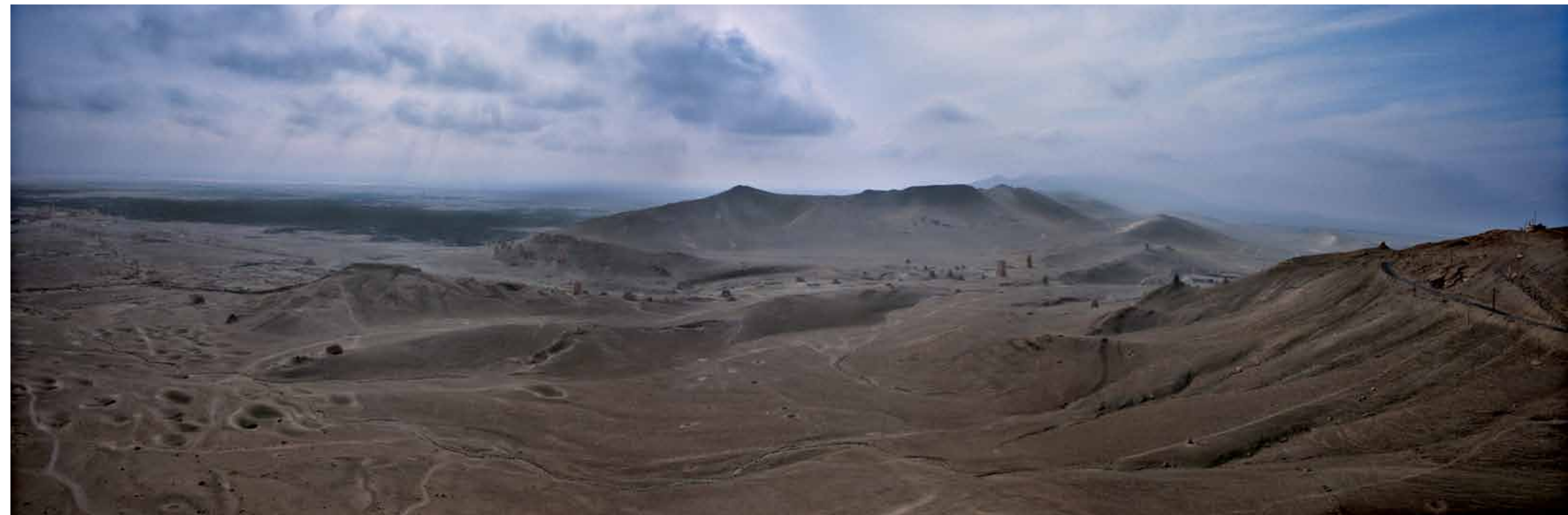
"Black Sun" Vinyl print, 2010, 181 cm x 550cm