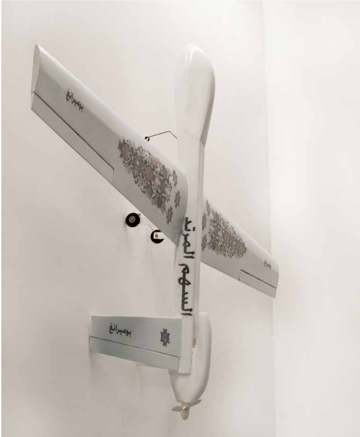
"Boomerang" 30cm x160 cm x 90cm